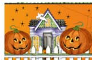
21107 O 1 ⅔ yards