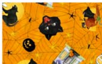
21108 O 3½ yards (backing)