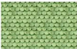
21109 G ¼ yard