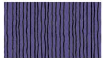
21112 V ¼ yard