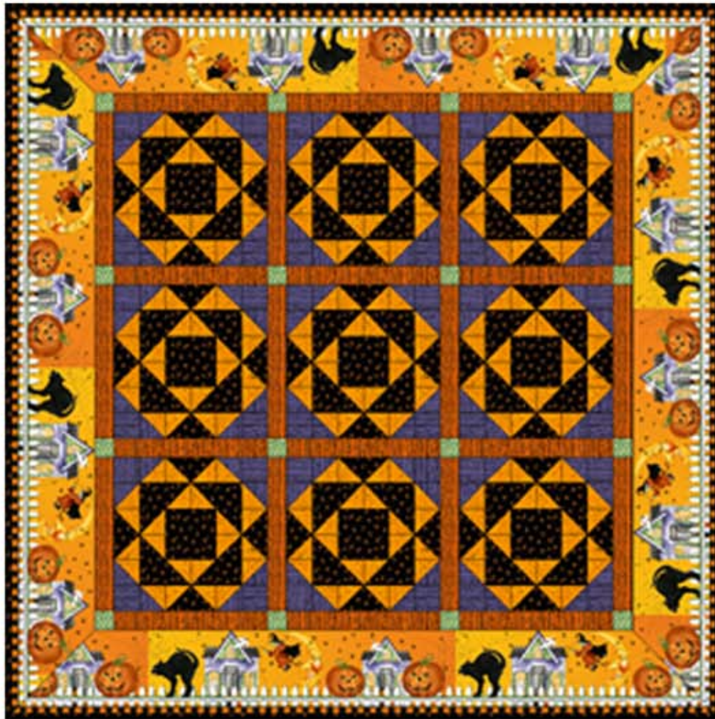
Finished Size: 55" x 55"