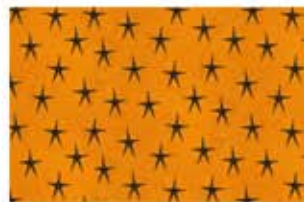
21110 O ⅔ yard