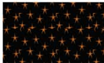
21110 J 1 yard