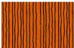
21112 O ⅔ yard