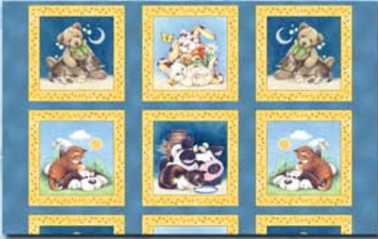
Fabric A 94051-452 1 Panel - 2/3 yard