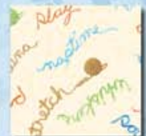
Fabric H 94058-143 1 5/8 Yards (piecing) 5 1/4 yards (backing)