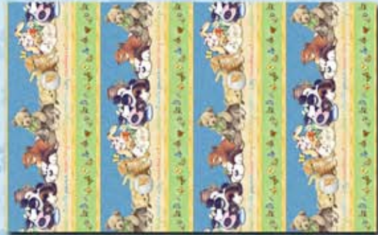
Fabric B 94052-475 2 yards