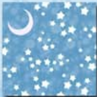
Fabric E 94056-411 1/2 yard