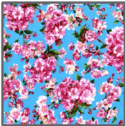
DC4125 Spring Primavera Blossom Fat 1/4