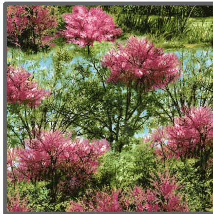
DC4124 Spring Primavera Garden Fat 1/4

Backing - 55" x 55" and Batting - 55" x 55" required