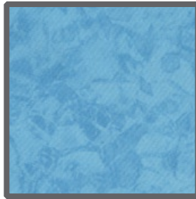
K1160 (Sky Blue) Krystal 1 1/2 yard