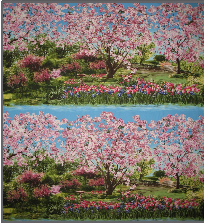
DC4123 Spring - Primavera 1 Panel or 2/3 Yard